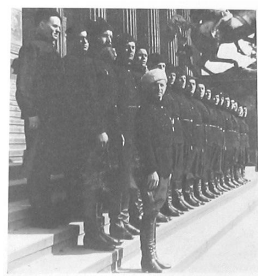
Serge Jaroff & Don Cossacks

“The music contained in this album is a miscellany of Russian songs, many of which are on the lips of the brave peoples of Fighting Russia today.” Album liner notes